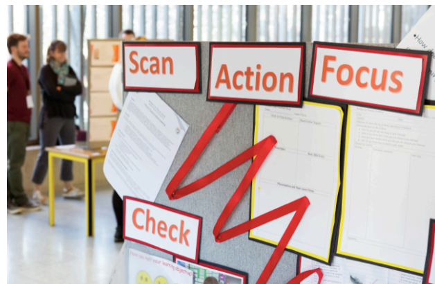
Image from the WEN mid-year event in Wigan

Two of the participants from the tour last spring work in special education settings in England. As a result of their visit to BC, they will be speaking at the upcoming NASS conference in Brighton about how teachers of children with special education needs can bring more curiosity to their roles.